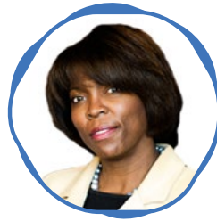
Ambassador Ertharin Cousin Vice Chair (USA)